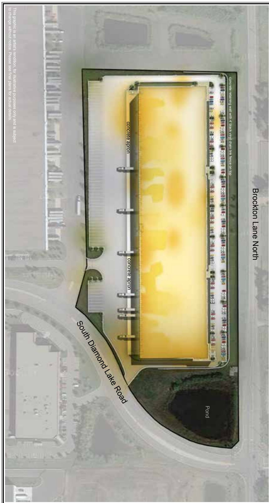
Site Plan Rendering